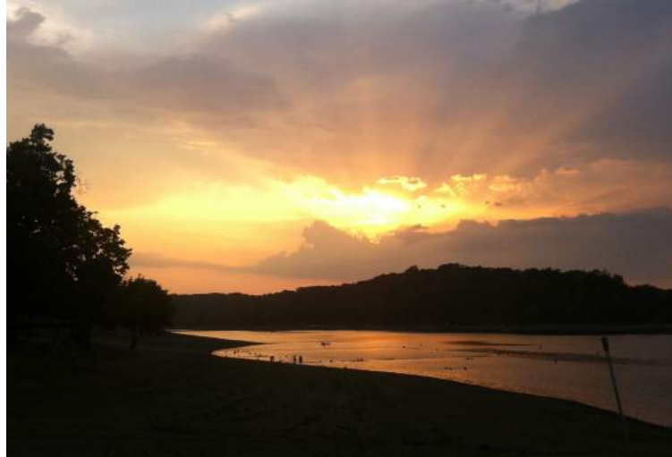
Beaver Lake

follow on Twitter | friend on Facebook | forward to a friend