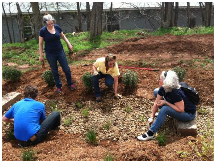
Participants at the Spring Rain Garden Academy installed five rain gardens in Huntsville last month