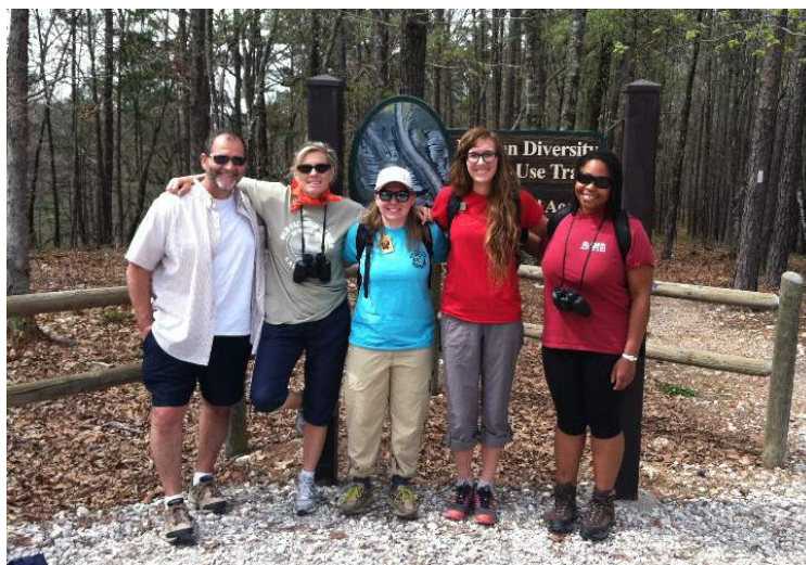
Hikers identified native plants, learned about Leave No Trace ethics, and