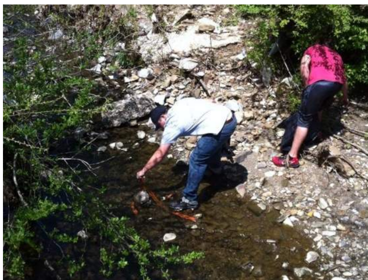
Volunteers from the University of Arkansas removed 300 pounds of trash from 1/4 mile of Mullins Creek in honor of Earth Day