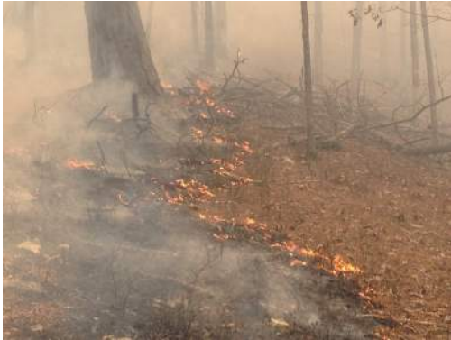
Controlled burn taking place at Hobbs State Park Conservation Area.

Beaver Watershed Alliance hosted a series of 6 community meetings for owners and land managers of 40 acres or more of which 75 percent is forested and within the Beaver Lake Watershed this Summer. One-hundred thirty four individuals from all around the watershed participated and provided valuable information relating to the needs and interests of forest landowners. A list of informational and technical needs, and program recommendations valued by our forest landowners and managers were made and BWA will be carrying out workshops over the next year based on the feedback we received with our partners like the Arkansas Natural Heritage Commission, Hobbs State Park and the University of Arkansas Division of Agriculture. We will also incorporate this information into a Forest Management section of the Beaver Lake Watershed Protection Strategy for other forest landowners to consider.