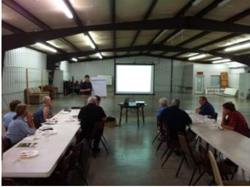
Forest landowners participating in the West Fork community forest landowner meeting.