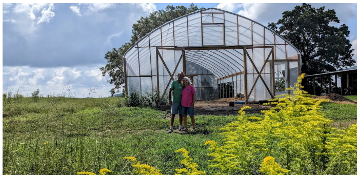
Above: David and Karma Nees, of Nees Farms, smiling in front of their recently installed high-tunnel.

If you are interested in purchasing native plants for your project, we encourage you to contact these growers in the NWA area. Also, we have wonderful local nurseries, such as White River Nursery in Fayetteville, that continue to supply native plants.